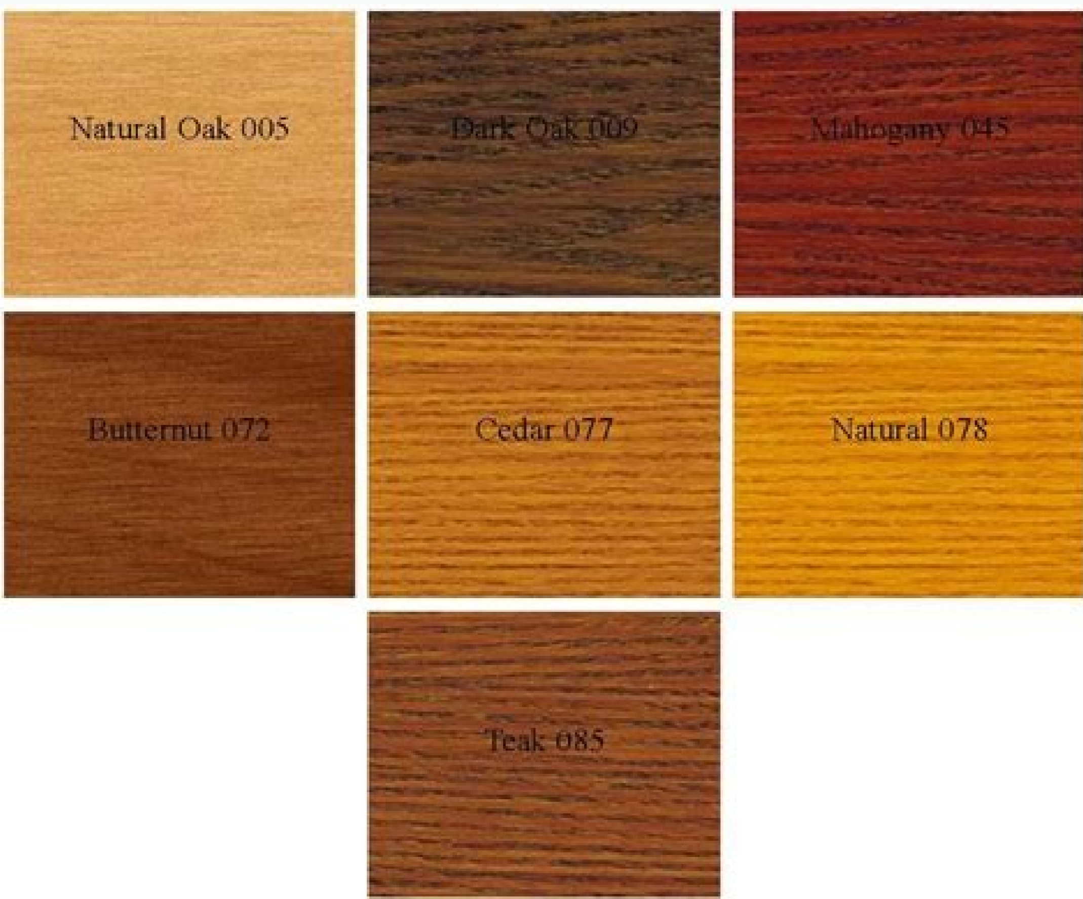
How to apply sikkens cetol hlse. How to apply sikkens cetol 1.